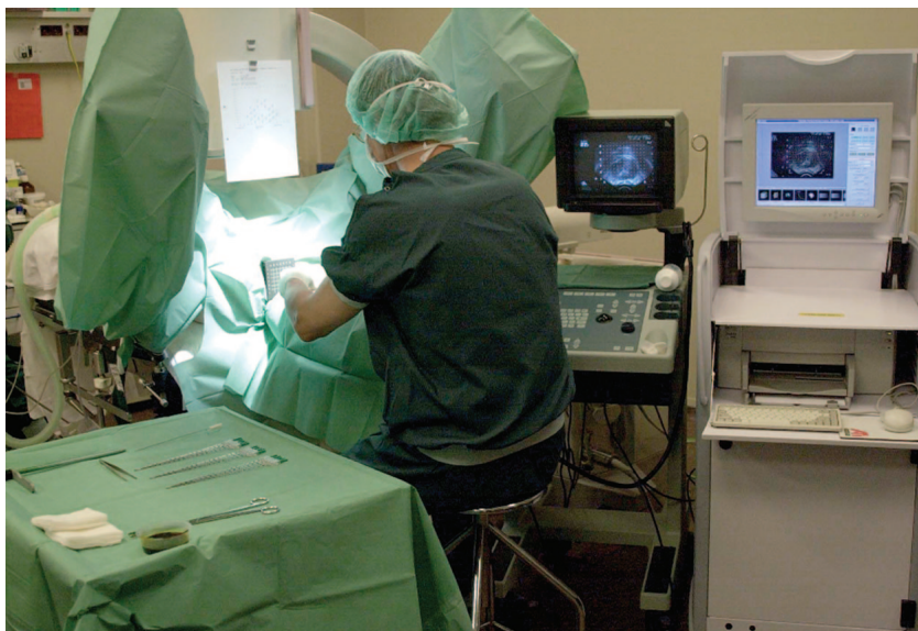
The 'Selectron' automated treatment delivery systems allow workflow to be streamlined and minimise the number of staff required per procedure

Cervical cancer is the second most common cancer in women aged under 35 in the UK, with over four million women being screened for this and other abnormalities each year. In addition, endometrial, vaginal and vulvar cancers account for approximately 6% of all female cancers diagnosed in the UK per annum. Nucletron's latest development for the treatment of gynaecological cancers, Oncentra GYN, uses the same therapeutic approach as that for high-risk prostate cancer - conventional radiotherapy combined with HDR brachytherapy.