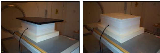
Figure 1. Experimental set-up with and without carbon fibre top/insert in the beam line.

The attenuation of the carbon fibre couch tops/inserts was measured at isocentre in a 20 cm thick polystyrene phantom with the detector at 10 cm depth. The equipment for measurement consisted of ionization chambers of Baldwin-Farmer type (Nuclear Enterprise, UK) and electrometers (Sun Nuclear, USA and PTW, Germany). Measurements were made with and without the carbon fiber top/insert in the beam for 4, 6, and 10 MV photons, see Figure 1.